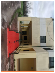
RAMPA DI ACCESSO INGRESSO 2