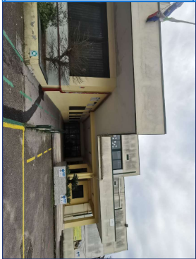
RAMPA E GRADINI DI ACCESSO INGRESSO 1